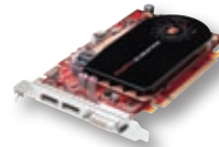
ATI FirePro™ V5700