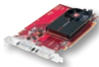
ATI FirePro™ V3700