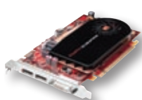
ATI FirePro™ V5700