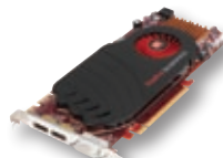
ATI FirePro™ V7750